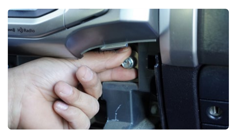
STEP 8 | Install the control cluster and dash trim by applying pressure until the clips are secured.