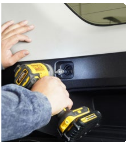
STEP 5 | Remove the plastic tie down next to the rear lift gate door by turning it to unlock, and pulling it out.

Remove the screw behind the plastic tie down with a phillips head screwdriver.