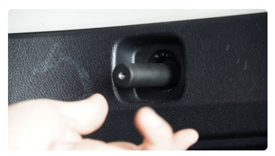
STEP 7 | Begin installing molle panel by securing it to the factory mounting location above the rear window using the factory bolt and a 10mm socket.