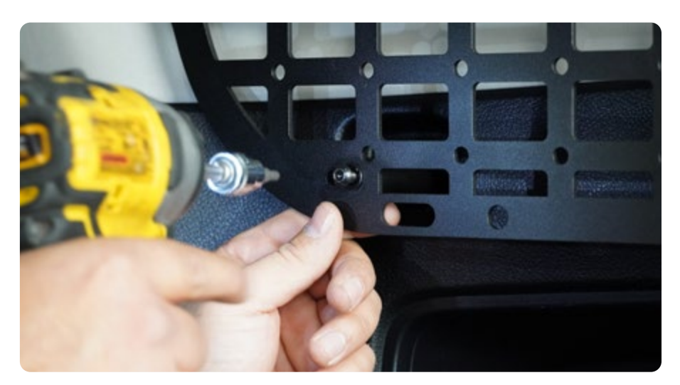
STEP 9 | Congrats! You are finished with the install of the 2010+ (5th Gen) Toyota 4Runner Rear Window Interior Molle Panel